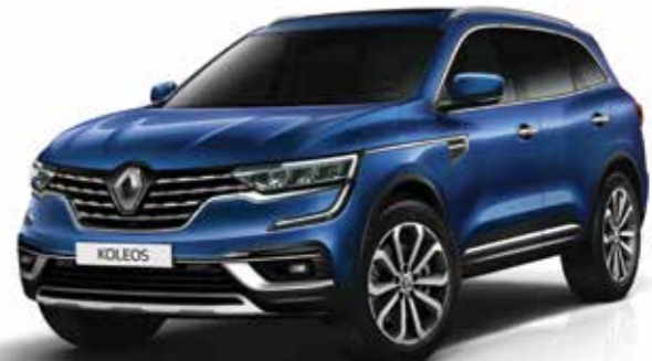
MEISSEN BLUE (MP)

Note: Printing limitations do not permit subtle paint shades to be shown with complete accuracy.