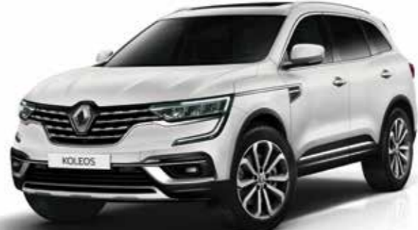
WHITE SOLID (NM)