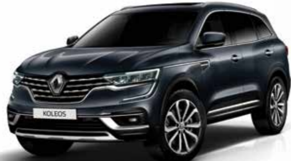
TITANIUM GREY (MP)